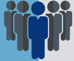
CITY OF EDWARDSVILLE POPULATION 1900-2017